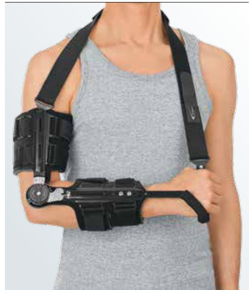
protect Epico ROM